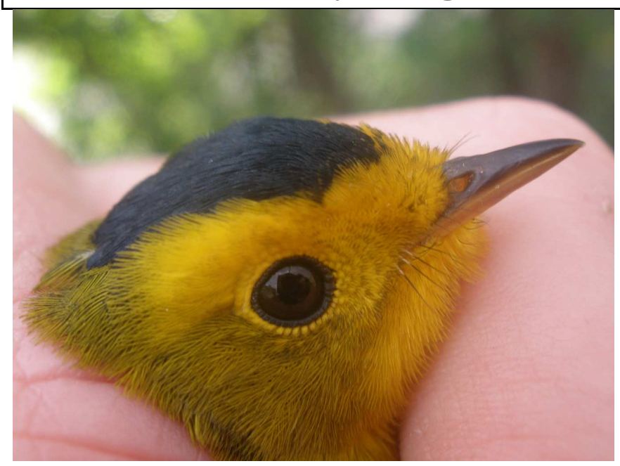
Over the past few years, Wilson's Warblers have outnumbered most other species at the Ridgway banding station.

The days get shorter. Storms appear from the wrong direction. Back-to-School Sales come and go. It must be bird-banding season again.