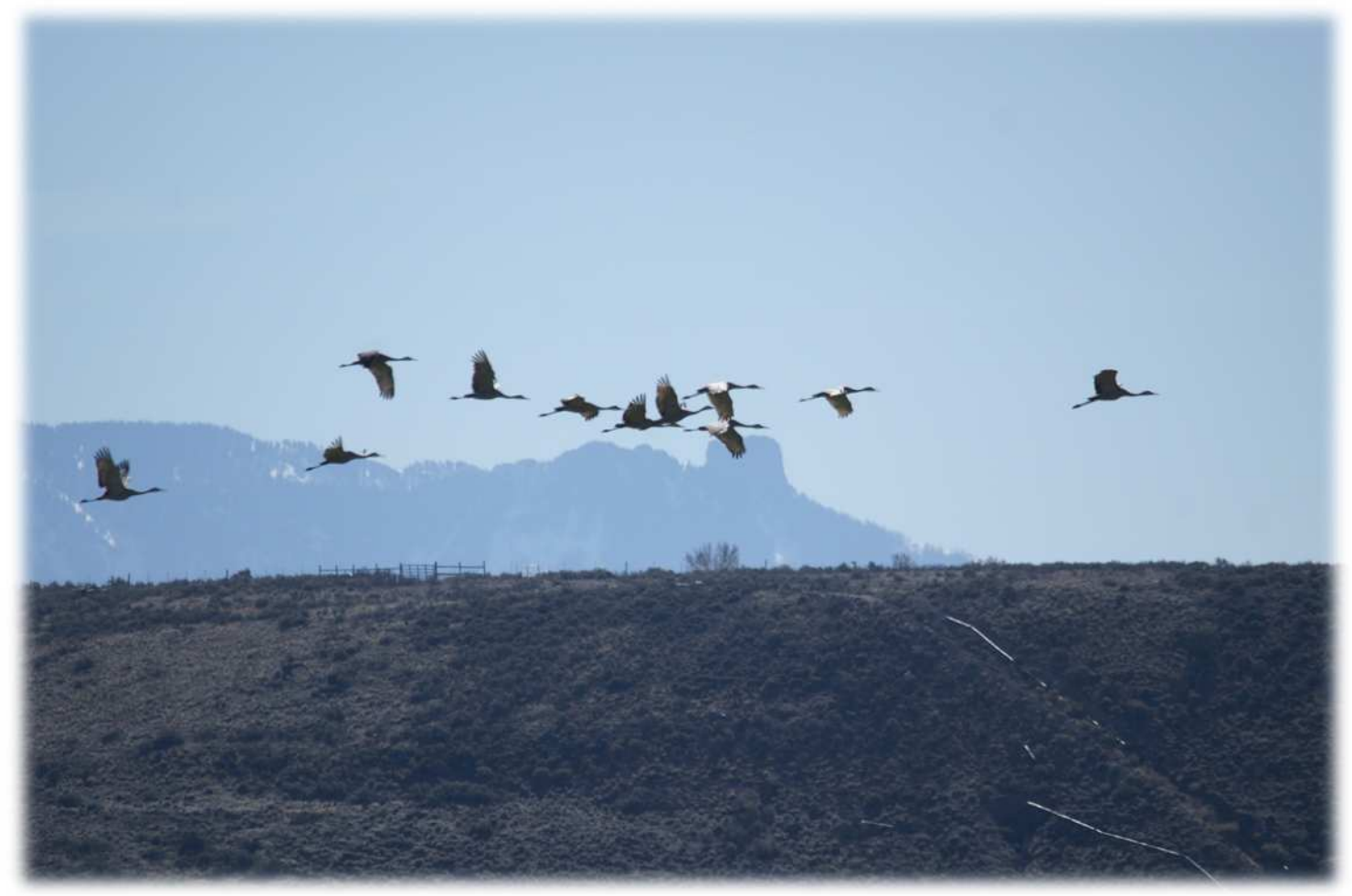
A flock of Sandhill Cranes in front of Cimarron Ridge.