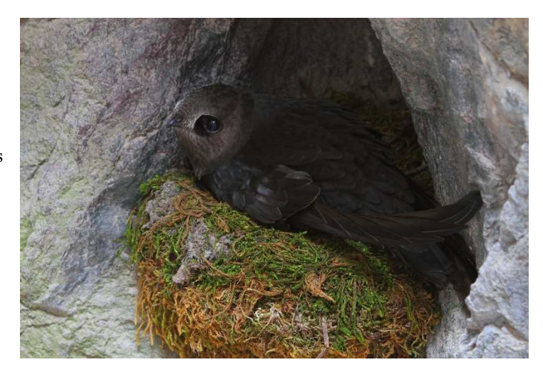
Black Swift at Box Canyon in Ouray.