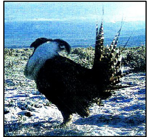
Most Gunnison Sage-Grouse live in the Gunnison Basin. This one was photographed at a lek near Crawford using a remote camera.

Both the listing decision and the Critical Habitat document do a good job of emphasizing the importance of the six smaller populations and explaining how most, if not all of them, are in danger of not surviving. This is due to the lack of remaining genetic diversity caused by very low populations, and the small size of the habitat, caused by fragmentation both between and within the population areas. It is important that the Critical Habitat document proposes to include some habitat that is adjacent to, but not currently occupied by the grouse.