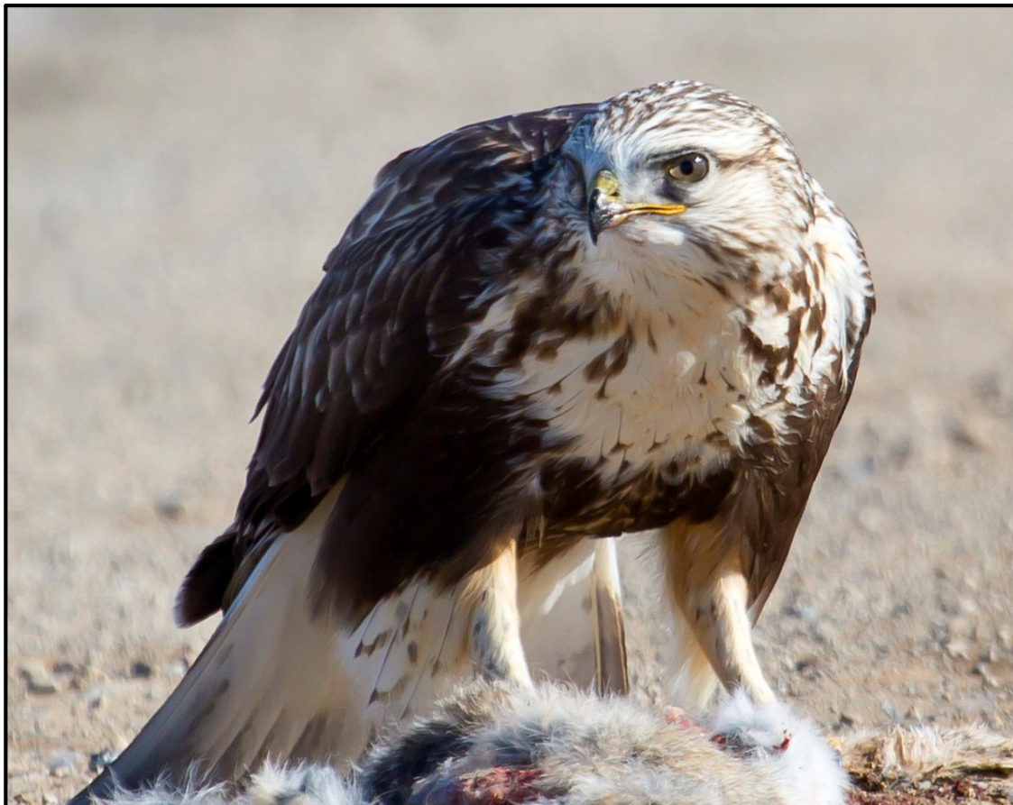
According to the Hawk Mountain Sanctuary Association, "Rough-legged Hawks feed on many species of carrion, particularly in winter when small mammals are inaccessible due to snow cover. Photo by Carole

The moral to this story is to always be ready – camera loaded, batteries charged and your eyes open. Even when you think your day is over, there could still be something special around the next corner.