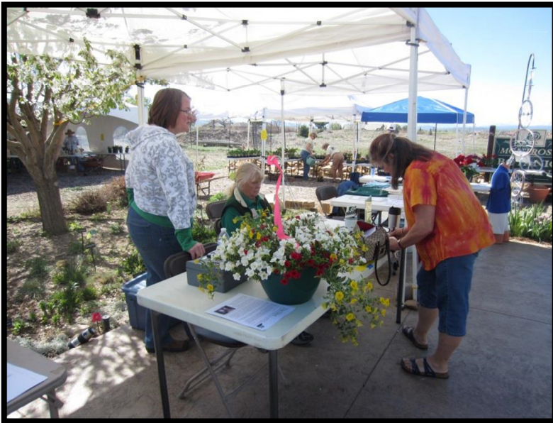
The plant sale was a chance to connect with local gardeners on bird-friendly yards.